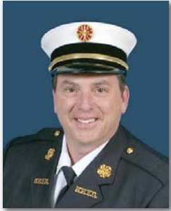
2008 - current

I would like to start off by thanking everyone who had an opportunity to attend our annual dinner. The men and women of the fire department did an outstanding job as usual.